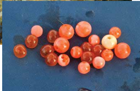
► Salmon egg imitations fool trophy rainbow trout.

the way to go. Most lodges provide all the flies you'll need, but if you prefer to tie your own a call to the lodge manager will point you in the right direction for proven fly recipes. My favorite pattern for salmon is a purple and black creation that's very similar to what we use for tarpon in Everglades National Park's tannin-tinted waters. On my last trip to Hoodoo Lodge I caught five species of salmon on