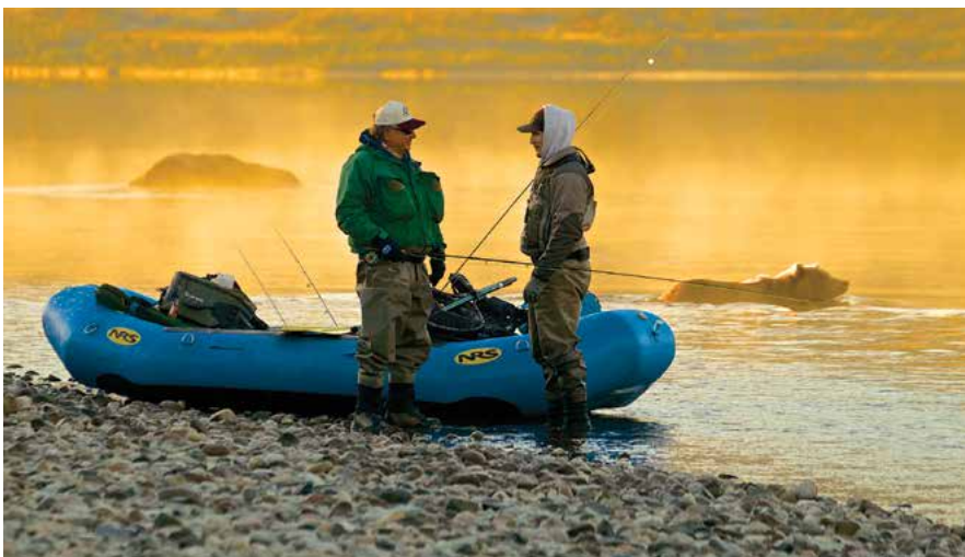
▼ Avid fly anglers will come to realize that Alaska really is heaven on earth.

if you aren't dressed right. Before purchasing a bunch of gear be sure to contact your lodge, because most have waders and boots for rent. You'll also want a backpack to carry extra clothes, equipment and most definitely don't forget your camera. Alaska is one of the most amazing places left on earth, and each trip will create lasting memories you will cherish for years to come. FSF