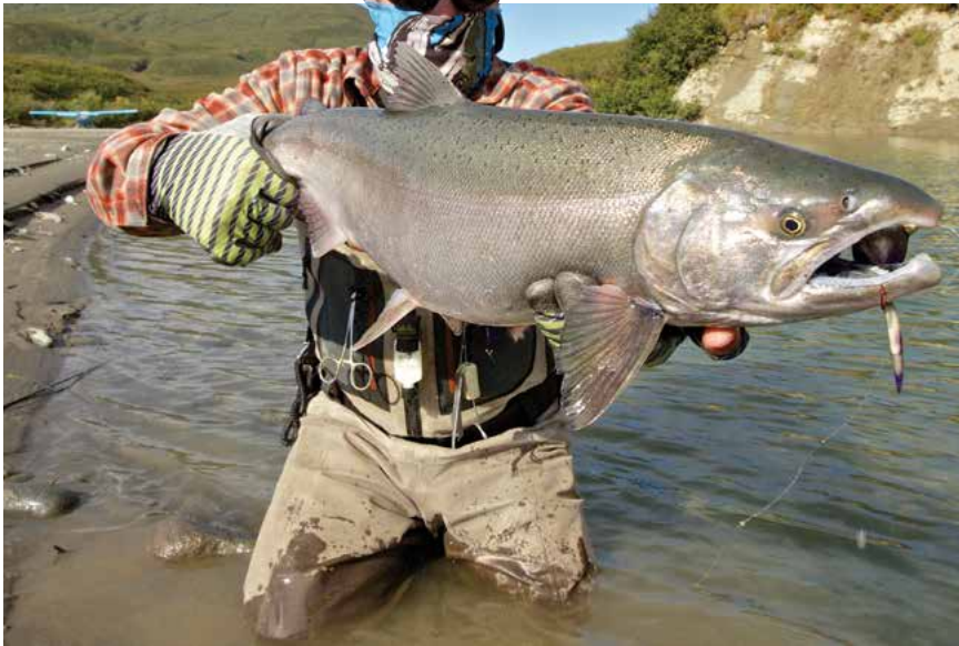
◀ Fly out operations provide anglers with the unique ability to experience a different fishery every day.

streams that gives visitors the privacy and action many other lodges cannot provide. Whatever you want to do is only a short plane ride away. Unfortunately, fly out lodges are expensive, but considering the circumstances it's money well spent. You definitely don't want a lodge that cuts corners on aircraft maintenance.