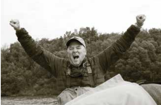
Victory is sweet for the "old man."

Below, a week of solid fishing lessens the learning curve of hooking, fighting and landing fish.