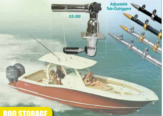
Adjustable Tele-Outriggers GS-280