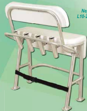
Neptune III L10-2010BSA-1