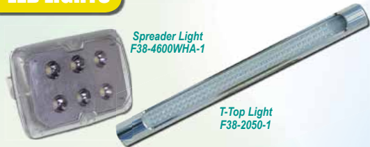
Spreader Light F38-4600WHA-1