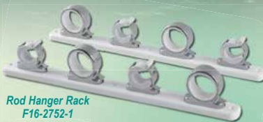
Rod Hanger Rack F16-2752-1